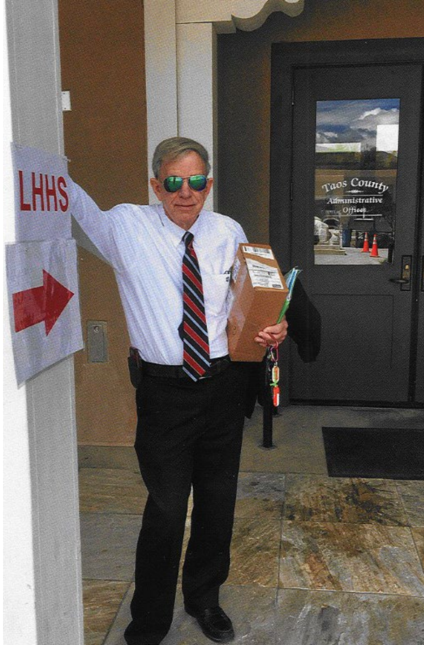
Moving a bill through the State legislature