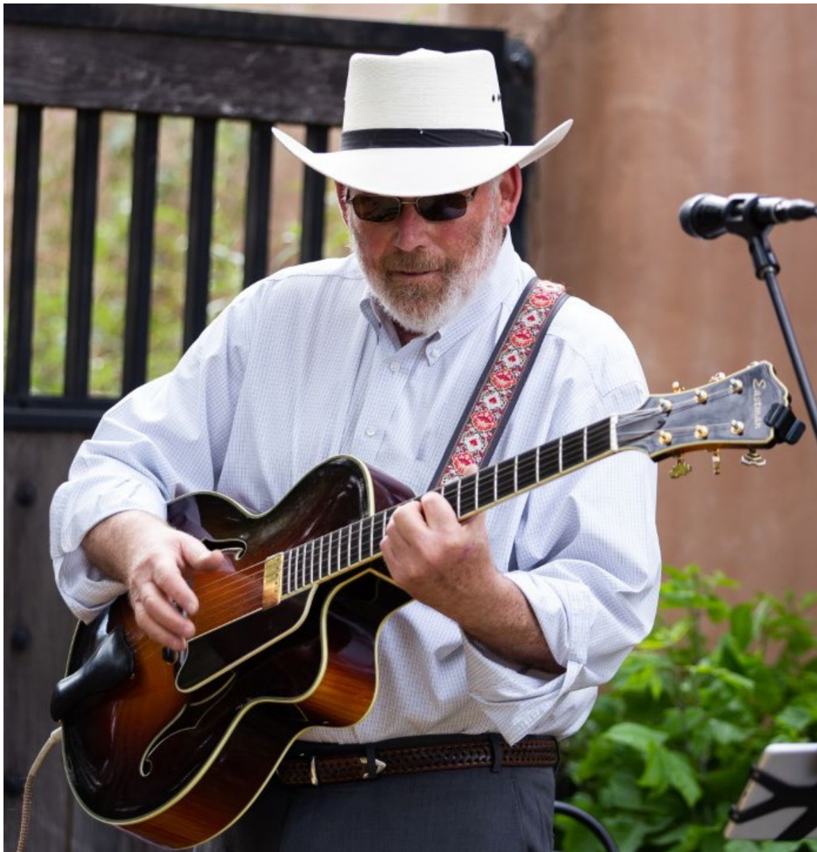
Practicing on his favorite guitar for a nightly session for a gig in Albuquerque