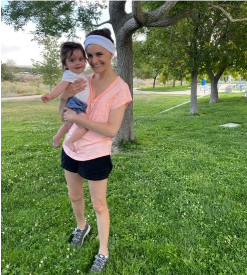
Newest Family Addition