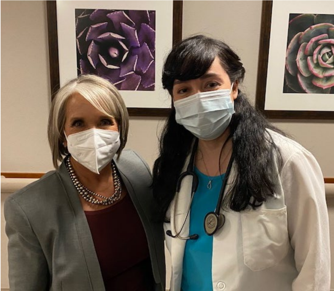
Working with the Governor to benefit diabetic patients in New Mexico