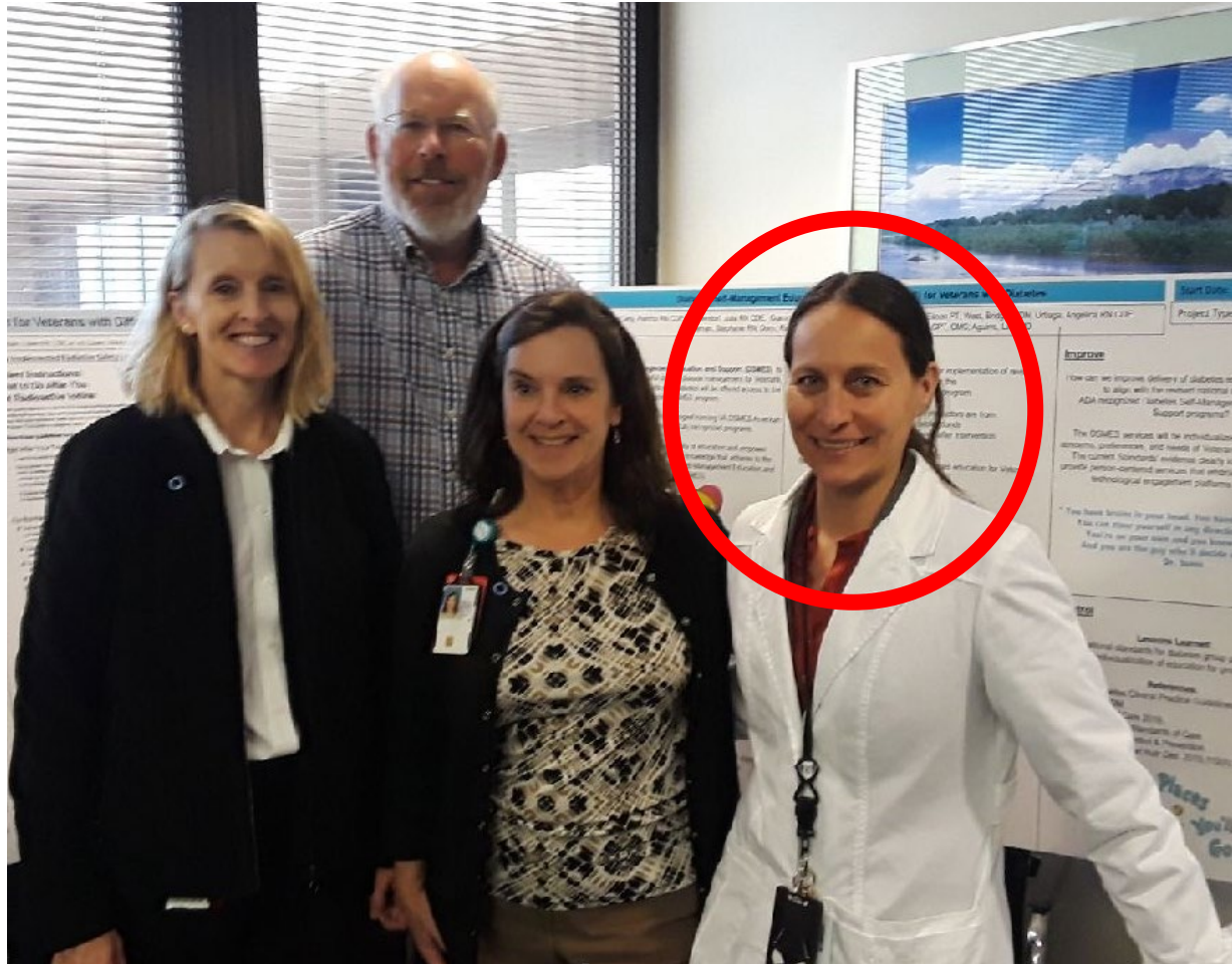
Working Group in New Mexico - #1 for diabetes productivity in the United States VA system