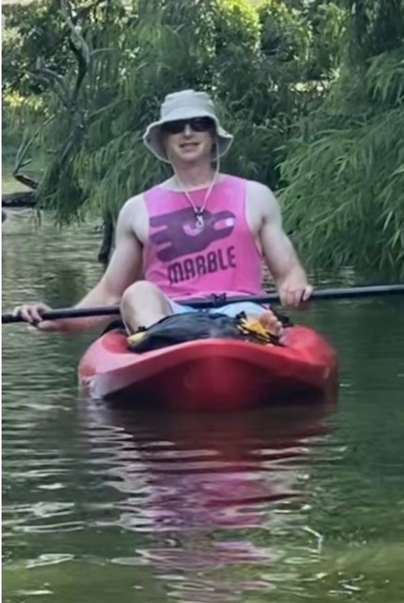
White water rafting on the Rio Grande