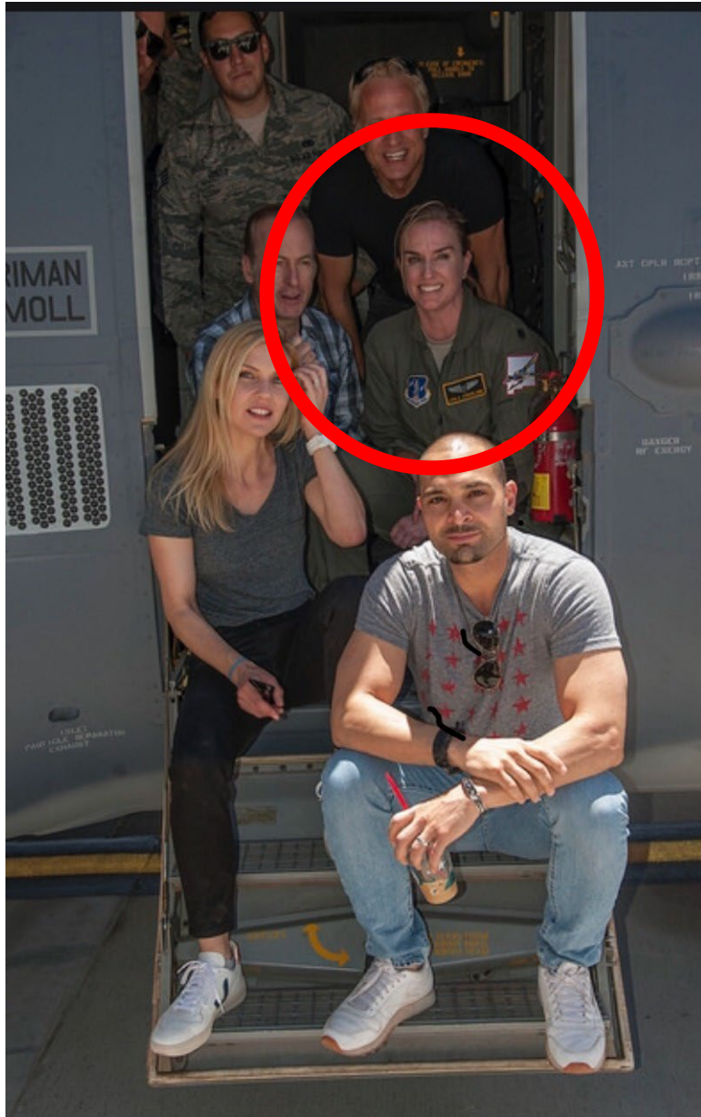
Cast for "Better Call Saul" on Netflix