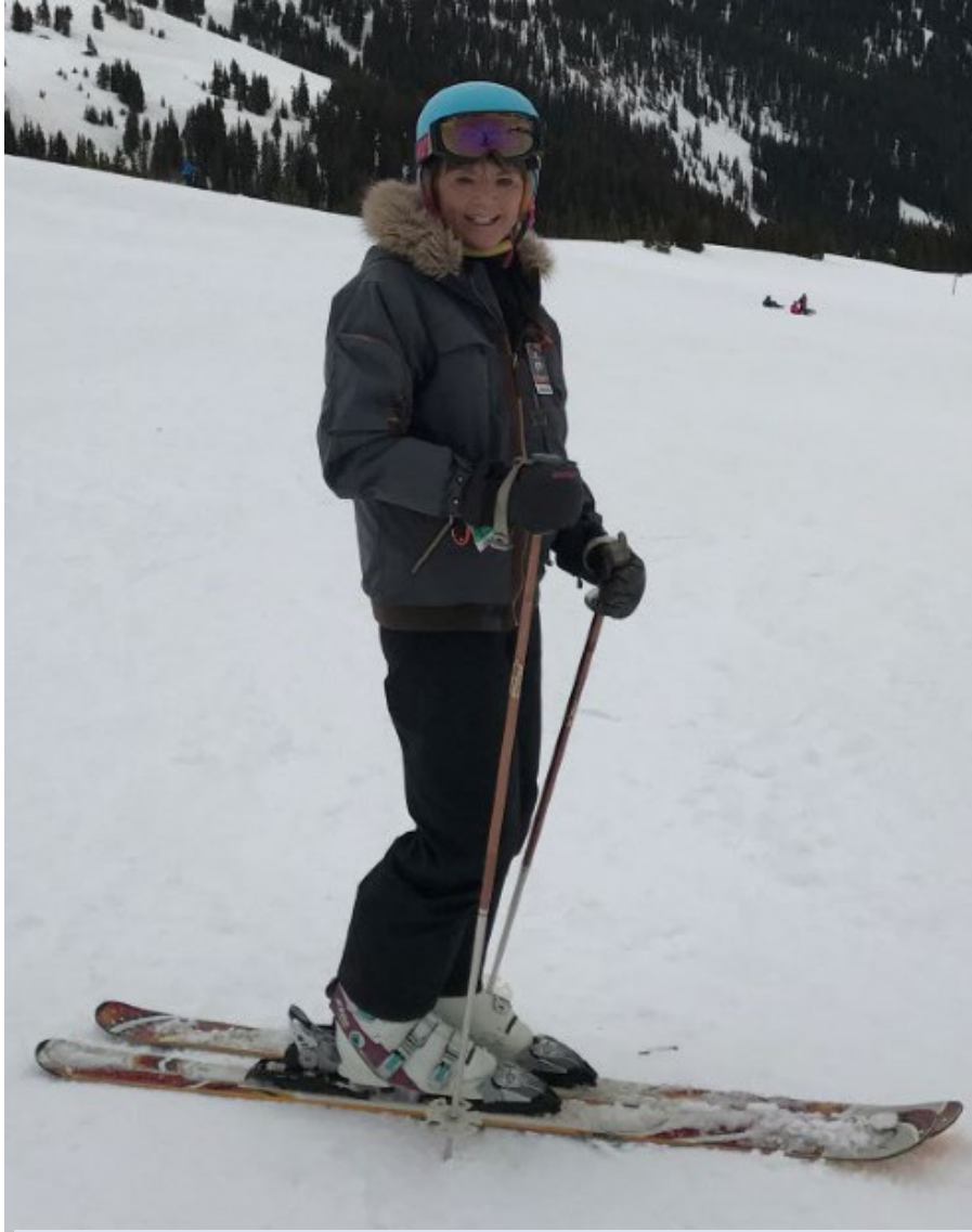
Skiing in Angelfire