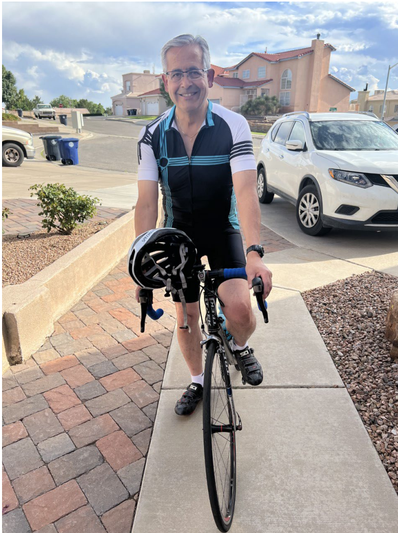
Doing what he loves best in New Mexico